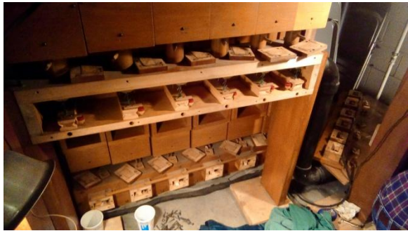
Bourdon offset primary pneumatics exposed

resoldering of string offset contacts at our April 10<sup>th</sup> work party.